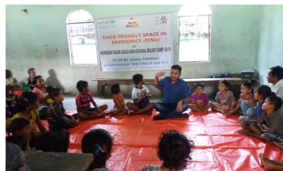
Children engaged in playful activities in Child Friendly Spaces in Auniati high school Relief Camp, Majuli