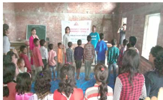
Inspector of Schools Dhemaji monitoring Child Friendly Spaces in Jonai HS Relief Camp

Setting up of “Child Friendly Spaces in Emergencies” is mandated as per National School safety Policy (NSSP). Therefore ASDMA in collaboration with other line departments like State Education Department, Social Welfare & Health and international agency UNICEF & local NGOs operationalized CFS for the first time in Assam in flood relief camps. A Pilot project was initiated in two districts namely Majuli & Dhemaji for documenting the experiences. Based on experiences and challenges captured during the Pilot project, ASDMA will notify a detailed guideline for the