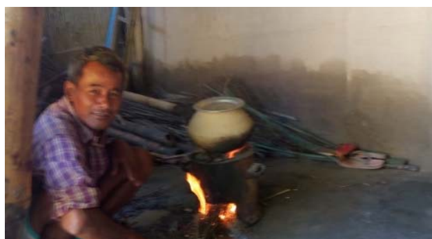
An Elderly person in Hindujaopori, Morigaon using Fuel Efficient Cook-stove distributed by ASDMA