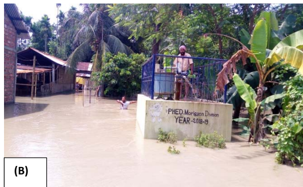
Post Flood season in 2019 (A) Women in Hindujapori, Morigaon fetching water from raised hand-pump funded by ASDMA (B) Raised Hand-pump fitted with water purification unit in Hindujapori, Morigaon used by people during Flood